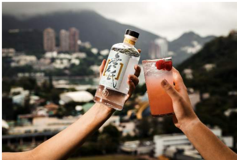
Caption: Guests attending the pop-up will also be the first to try the new release of N.I.P Exotic City Blend featured in cocktails such as Exotic Summer , a fruity crush of raspberry, passion fruit, citrus, bergamot tonic and a hint of Scrappy's Bitters Firewater.