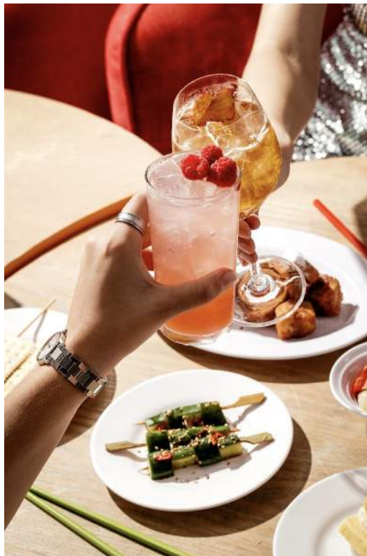
Caption: Masterfully perfected by the notable Sandeep Kumar, tipples include The Peppery Mule , a concoction of N.I.P Rare Gin with a bittersweet Rinomato Suco, rhubarb and ginger topped with effervescent ginger beer as well as the Exotic Summer cocktail .